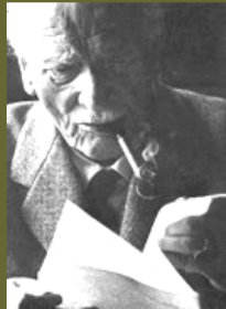
Carl Gustav Jung